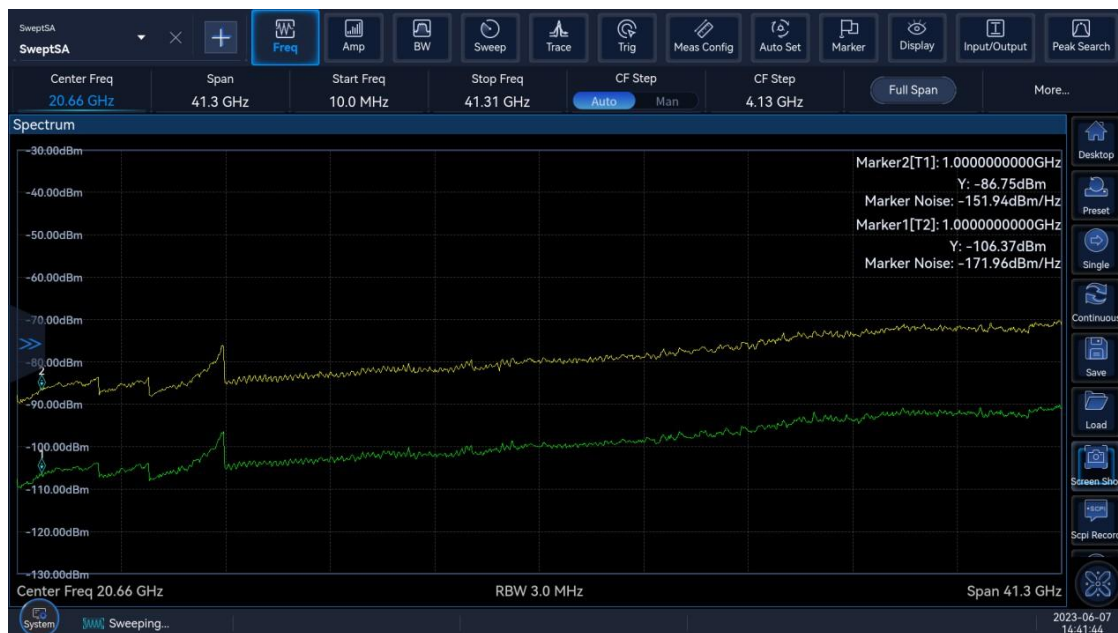
DANL Specification with Pre-amplifier ON or OFF

With excellent amplitude measurement accuracy, the signal amplitude measurement accuracy in the frequency band below 8GHz is better than \pm 0.5 dB.