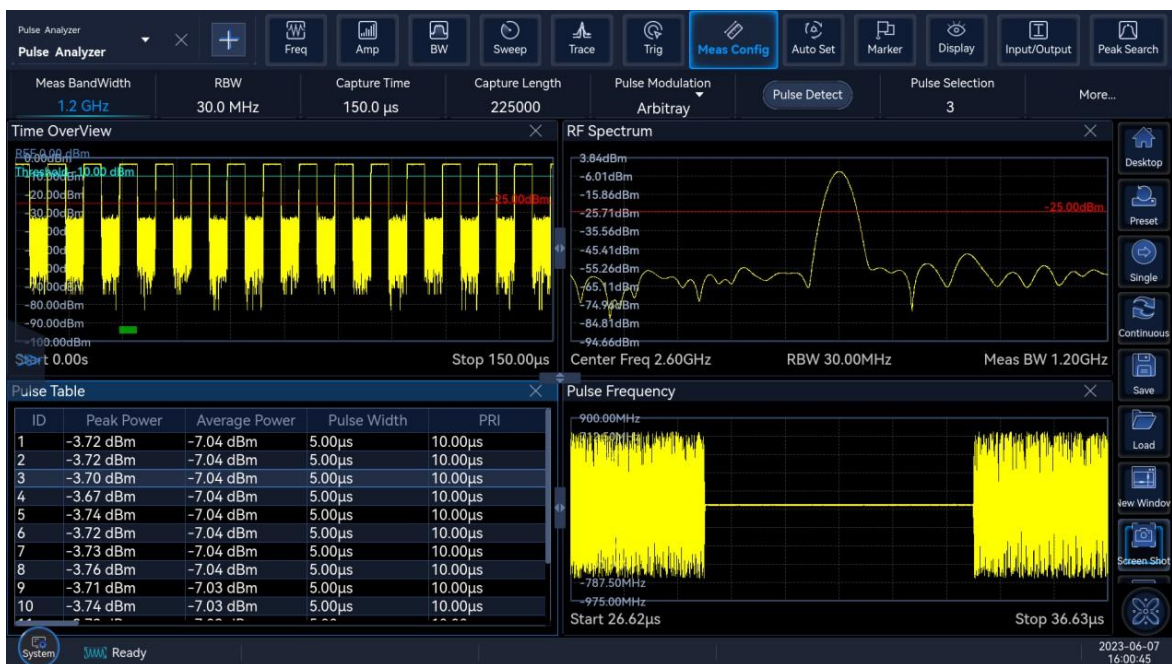
1.2GHz Analysis Bandwidth Measurement

The spurious-free dynamic range under the 200MHz analysis bandwidth is -75dBc, and the spurious-free dynamic range under the 1.2GHz analysis bandwidth is -65dBc.