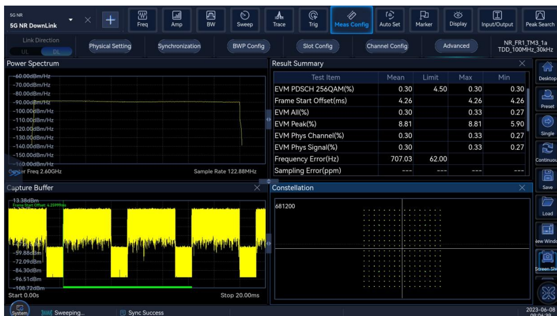
5G NR Signal Analysis Measurement

In terms of out-of-band measurement, it can provide a wide range of standard and limit line one-key setting capabilities, and efficiently perform adjacent channel leakage ratio (ACLR), spectrum emission mask (SEM) and other measurements.